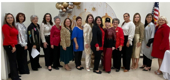
Rio Grande City-Roma Table members 2025 Christmas Posada "Gift to the World"